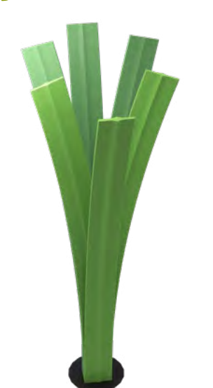
Our dual-colour and versatile PE monofilament yarn for landscape surfaces.