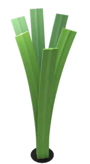
Our top performing monofilament yarn for contact sports.