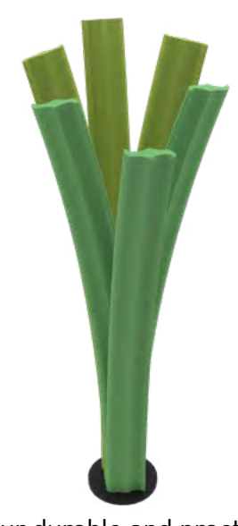
Our durable and practical monofilament yarn for contact and non-contact sports.