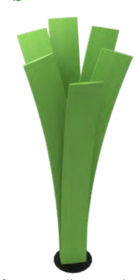
Our versatile texturised monofilament yarn for non-contact sports.