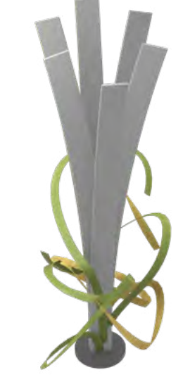
Our monofilament yarn that provides a realistic, lush multi-dimensional aspect.