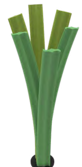
Our extremely durable monofilament yarn for contact and non-contact sports.