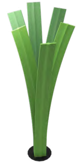
Our high performance and economical monofilament yarn for contact sports.