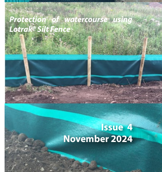
Protection of watercourse using Lotrak ® Silt Fence